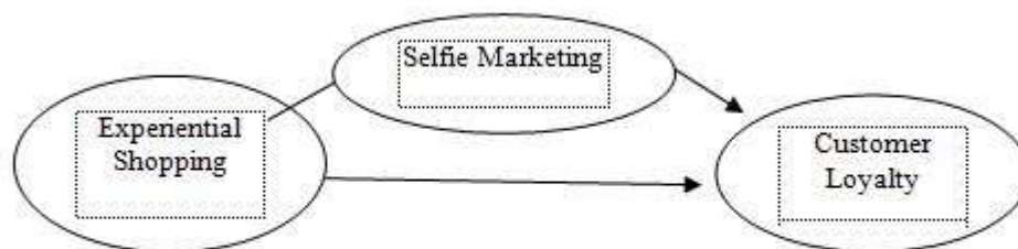
Figure 1. Research Model

The authors propose a model that describes the relationship between experiential shopping, selfie marketing and customer loyalty (See Figure 1). . In conclusion, the results are discussed along with the theoretical and managerial implications of the findings.